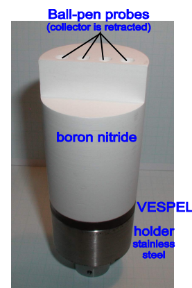
Fig. 1. The ball-pen probe head for the experiment on RFX-mod

The BPP head developed for the RFX-mod experiment is shown in Fig. 1. The probe head is made of boron-nitride material with four shafts where the collectors are located. The collectors are made of graphite at different positions h with respect to the mouths of the shafts: 0 mm, -3 mm, -6 mm, -9 mm. Collectors have diameter of 4 mm and the probe head itself has a diameter of 50 mm and length of 90 mm.