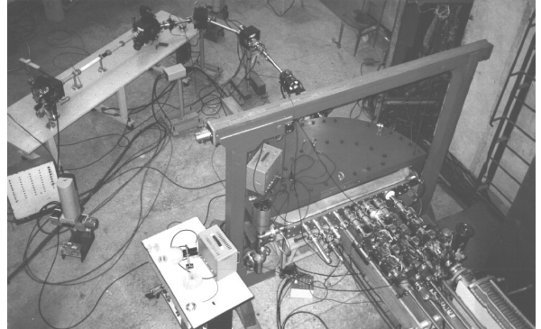
Fig.1 Layout of Lebedev Physical Institute Radiation Complex. Far Infrared FEL is at the upper left corner.