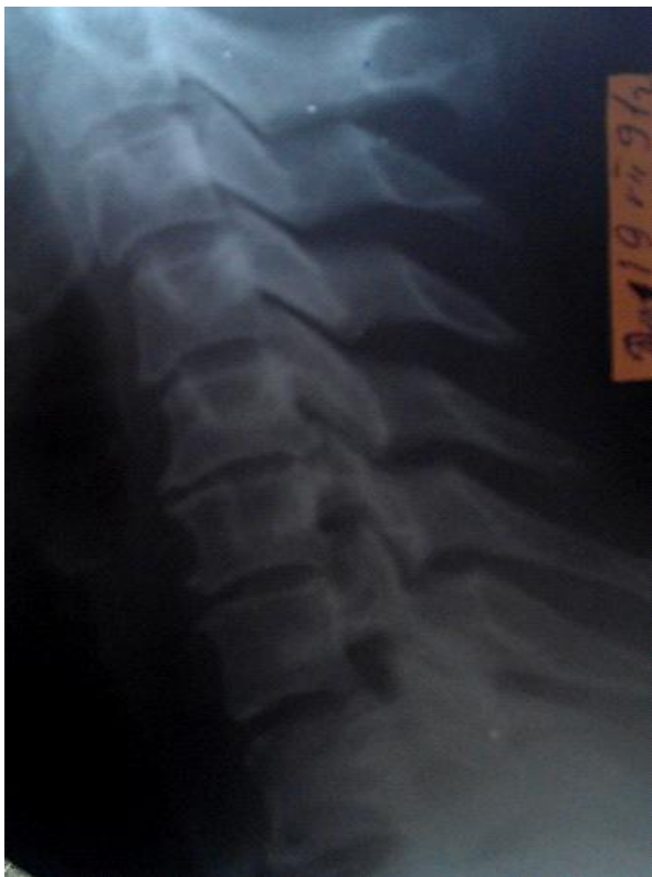
.3. .42 .

36-42 43 - 49 . - I - 50,7 % 65 % . - ( .2). 50-56 57 106 , - 6. 88 % ( .2), « » . - , , - , , - 80-120 . , - , - 12 , 7- , 5- ( .3). 106 , - , 6 - . 11 - 5 2-3 . 4- II - (1973). 78 (38%) .