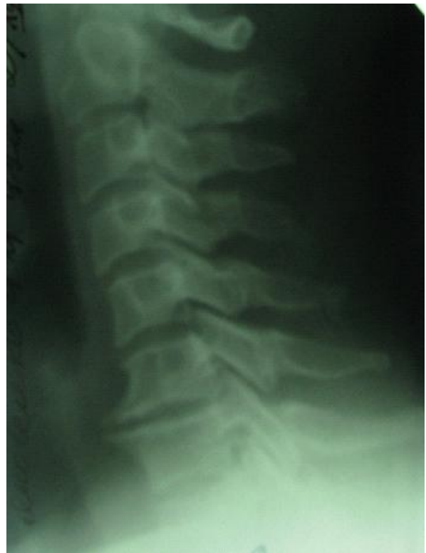
.4. ., 49 .