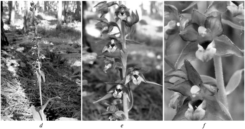
Plants, inflorescences and flowers of Epipactis taxa: a–c — Epipactis turcica Kreutz; d–f — E. helleborine subsp. orbicularis (C. Richt) E. Klein.

Рослини, суцвіття та квітки таксонів з роду Epipactis : a–c — Epipactis turcica Kreutz; d–f — E. helleborine subsp. orbicularis (C. Richt) E. Klein.