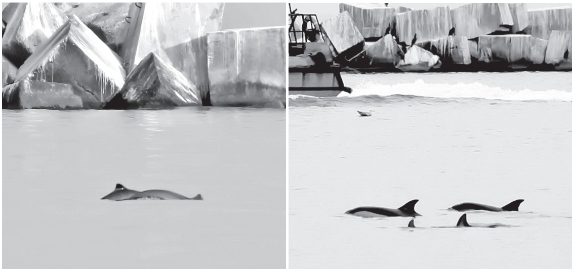
Fig. 2. Groups of harbour porpoises (female with calf; on the left) and common dolphins (adults with calf; on the right) in the navigation channel of Yuzhny Sea Port, near Hryhorivka village.

The primary type of cetaceans' behaviour in the waters of the estuary was feeding. In some cases we managed to detect that the feeding behaviour of cetaceans was associated with movements of large aggregations of fish: big-scale sand smelt ( Atherina boyeri Risso, 1810), representatives of a small species of the Mulletts family ( Liza sp.), whiting ( Merlangius merlangus Linnaeus, 1758), garfish ( Belone belone euxini Günther, 1866), and others. All the peak numbers of common dolphins (groups of 20–25 individuals observed in August 2015) coincided with the observed big aggregations of small sized mullet species such as golden grey mullet ( Liza aurata Russo, 1810) and leaping mullet ( Mugil saliens Risso, 1810); the sand smelt was also present in the area. Likewise, reports of local fishermen showed that the large groups of dolphins are encountered in the estuary during the seasonal migrations of mullets to the sea and back.