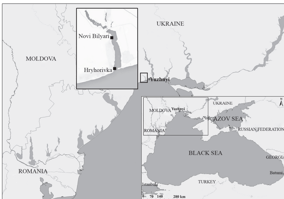
Fig. 1. Geographical location of Hryhorivsky Estuary.

The R software (R Core Team..., 2016) was used for the analysis and graphics.