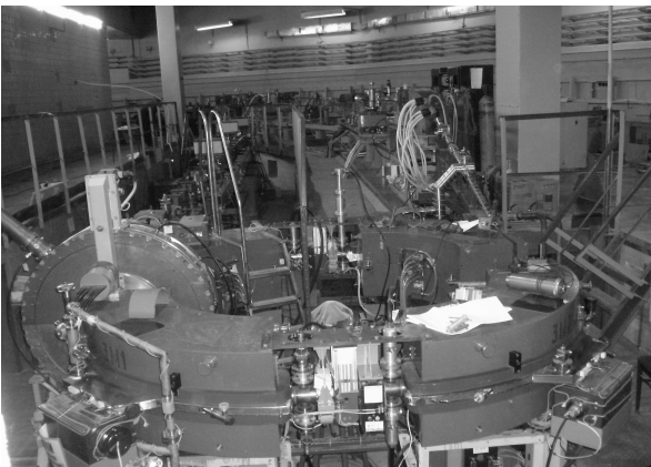
Fig.2. Small Storage Ring

Fig.2 shows the SSR preinflexor and inflector sections and an area of injection channel. The section I is put under injection septum, RF cavity and beam current sensor. Inside vacuum chamber of II and IV straight sections, including quadrupole lenses and vertical orbit corrector, there are plates of preinflexor and inflector plates. To compensate the chromatism in straight sections II and III the sextupoles are placed. In section IV there is octupole lens to compensate cubic nonlinearity of magnetic field. The extraction septum is placed in straight section III.