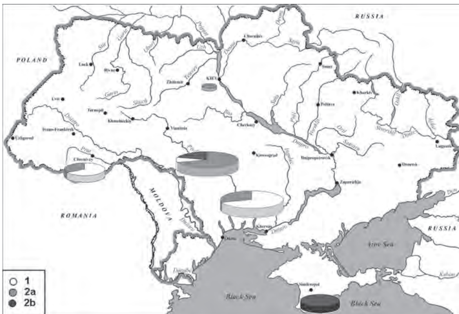
Fig. 3. Geographical distribution of the European roe deer mitochondrial lineages in the south-west of Ukraine: 1, 2a and 2b — mitochondrial lineages of C. capreolus .