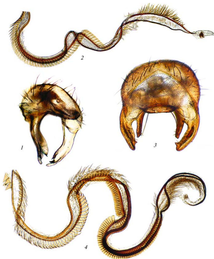
Fig. 3. Herina scutellaris (1–2) and H. narytia (3–4) male genitalia: 1, 3 — epandrium; 2, 4 — phallus. (Fig. 3, 3, 4 modified from Kameneva, 2007.)

Measurements: WL = 3.8–4.6 mm ( \sigma ), 4.1–4.6 mm ( \varphi ). BL = 4.5–5.2 mm ( \sigma ), 5.0–6.0 mm ( \varphi ). AL = 0.8 mm.