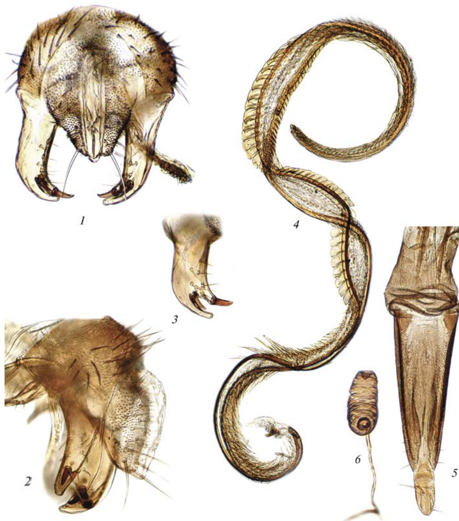
Fig. 2. Herina caribbeana , sp. n., ♂ (1–4), ♀ (5–6): 1–2 — epandrium (1 — posterior, 2 — left view); 3 — left surstylus, left lateroventral view; 4 — phallus; 5 — aculeus; 6 — spermatheca (one of the three).

Рис. 2. Herina caribbeana , sp. n., ♂ (1–4), ♀ (5–6): 1–2 — эпандрий (1 — вид сзади, 2 — слева); 3 — левый сурстиль, сзади и слева; 4 — фаллюс; 5 — вершинный членик яйцеклада; 6 — сперматека (одна из трёх).