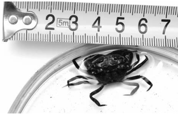
Fig. 3. Harris mud crab, Rhithropanopeus harrisii , from the Dneprovskoye Reservoir.

Рис. 3. Голландский краб, Rhithropanopeus harrisii , из Днепровского водохранилища.