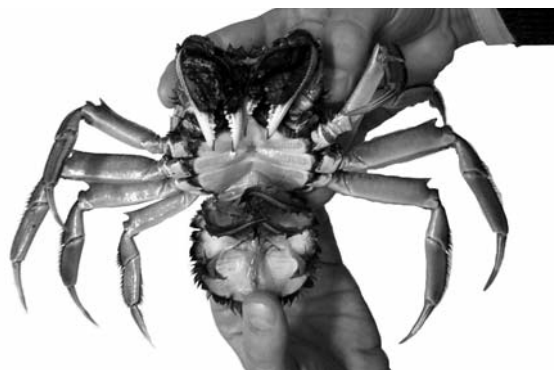
Fig. 2. Chinese mitten crab, Eriocheir sinensis , from the Dneprovskoye Reservoir. Рис. 2. Китайский мохнаторукий краб, Eriocheir sinensis , из Днепровского водохранилища.

Giant prawns of the genus Macrobrachium are a key element of modern freshwater aquaculture. In the former USSR, experimental cultivation of M. nipponense and M. rosenbergii (De Man, 1879) was organized in natural and warm-water reservoirs before 1970s (Suprunovich, Makarov, 1990). In 1986, M. nipponense was introduced into the Kuchurgan Liman (cooler reservoir of the Moldavian Hydro-power Station), waterbody on the Transdnistrian stretch on the border between Ukraine and Moldova Republic (Makarov, 2004). M. rosenbergii has been cultivated in the closed reservoirs of the Crimean