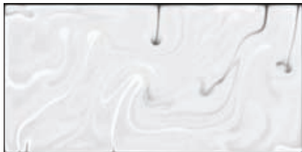
Fig. 2. 2D mantle convection at a Rayleigh number of 10^9 .

highly-optimized CUBLAS routines, allowing us to unlock a significant fraction of GPU's performance. This performance has enabled us to study the behavior of high Rayleigh number simulations, on the order of 10^9 , in 2D and 10^7 in 3D over sufficient time scales to see evidence of flow-reversal (Fig. 1).