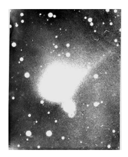
Figure 2. The image of Comet 67P/Churyumov-Gerasimenko on January 13, 1982

Original plates with images of Comet 67P/Churyumov–Gerasimenko were obtained by I. D. Karachentsev and K. I. Churyumov on January 12.105 UT and 13.124 UT, 1983 with the 6-m telescope BTA of the Special Astrophysical Observatory of the Russian Academy of Sciences (SAO RAS) at Mount Pastukhov. These plates are the first observations of a comet with one of the most powerful ground-based telescopes. The BTA is located at the gorge of Seven Brooks at a height of 2070 m. The diameter of its main mirror is 6.05 m and its focal distance is 24 m. A Ritchy cassette with a corrector and field lens was used. The pictures of Comet 67P/Churyumov–Gerasimenko are derived on emulsion Kodak IIaO with hypersensitivity in H<sub>2</sub>.