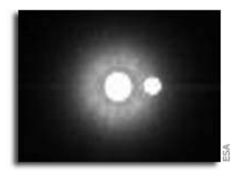
Figure 3. Image of the Earth and Moon made by the Rosetta CIVA imaging camera

On June 18, 2004 ESA's Rosetta comet-chaser has photographed itself in space at a distance of 35 million kilometres from the Earth. The CIVA imaging camera system on the Philae lander returned this image as part of its testing in May 2004.