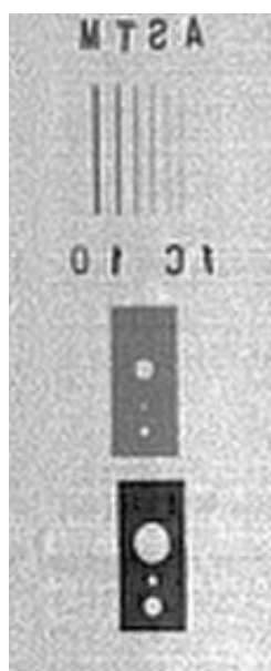
Fig.3. Wire and plate defectometers behind the 200 mm steel barriers