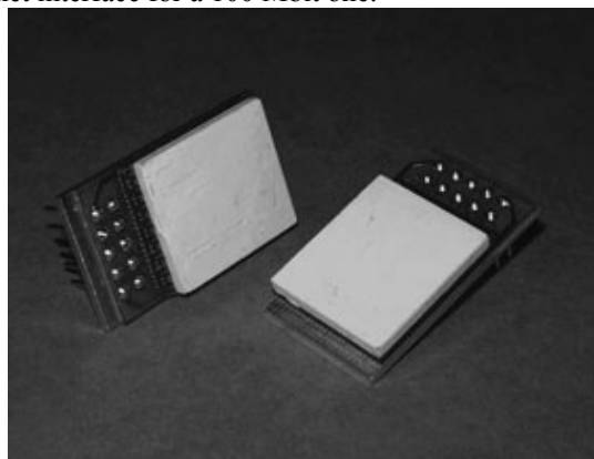
Fig.1. Detector modules (8 detectors each)

Besides, single scintillator-photodiode arrays were replaced with modular ones, each of 8 detectors (Fig.1), which resulted in a smaller gap between the detectors (0.5 mm instead of previous 0.2 mm) and higher accuracy of detectors' positioning. The detector pitch in the module is 2.2 mm. The scintillator side facing the radiation is 2 \times 2 mm. The scintillator dimension along the radiation propagation is 20 mm. The module is 32 \times 17.6 mm in sizes. The main point of the electronic part updating was application of a 24 bit sigma-delta ADC, as a consequence of which we had approximately twice the dynamic range and could substitute the 10 Mbit Ethernet interface for a 100 Mbit one.