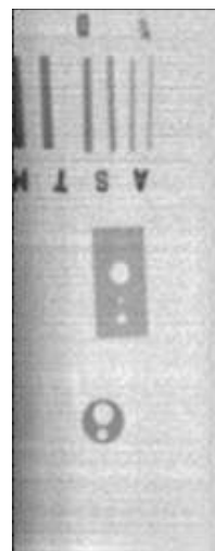
Fig.4. Wire and plate defectometers behind the 300 mm steel barrier

The data presented in the paper demonstrate that the latest updating of the system made possible to obtain higher spatial resolution of the system and, in addition, appreciably wider range of scanned thicknesses.