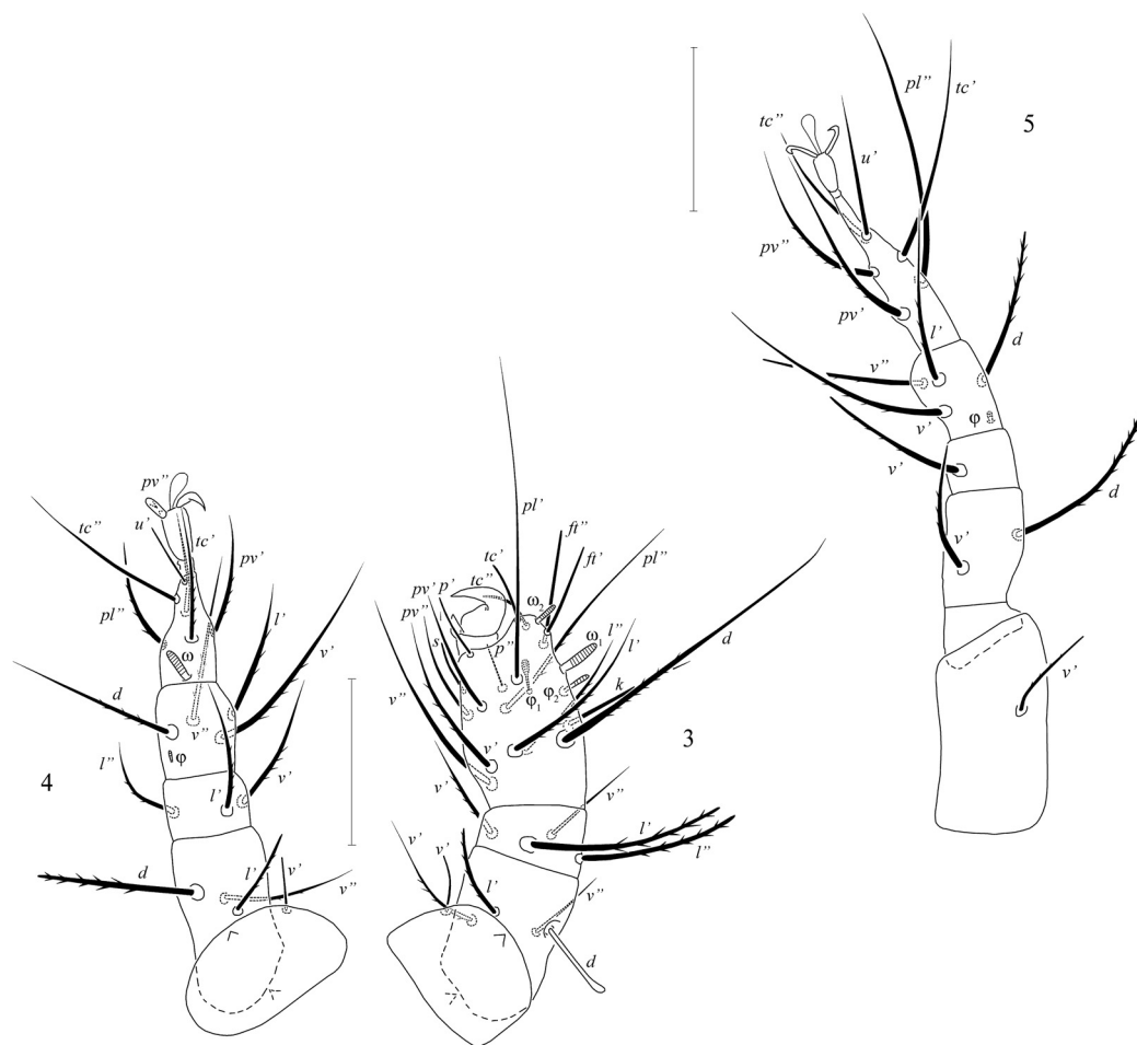
Fig. 3–5. Pediculaster dudinskyi , phoretic female: 3–4 — legs I and II, respectively. Scale bar 50 \mu\text{m} . Pediculaster dudinskyi , phoretic female: 5 — leg IV. Scale bar 50 \mu\text{m} .