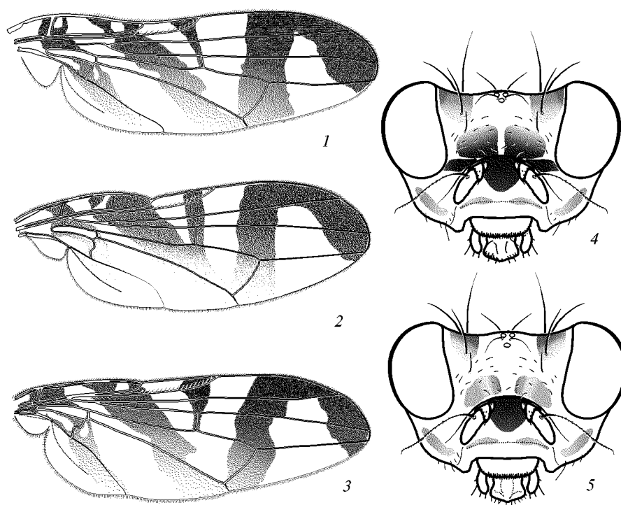
Fig. 2. Plagiocephalus , female: 1-3 — wing: 1 — P. latifrons ; 2 — P. lobularis ; 3 — P. intermedius ; 4-5 — head: 4 — P. latifrons ; 5 — P. intermedius .

Рис. 2. Plagiocephalus , самка: 1-3 — крыло: 1 — P. latifrons ; 2 — P. lobularis ; 3 — P. intermedius ; 4-5 — голова: 4 — P. latifrons ; 5 — P. intermedius .