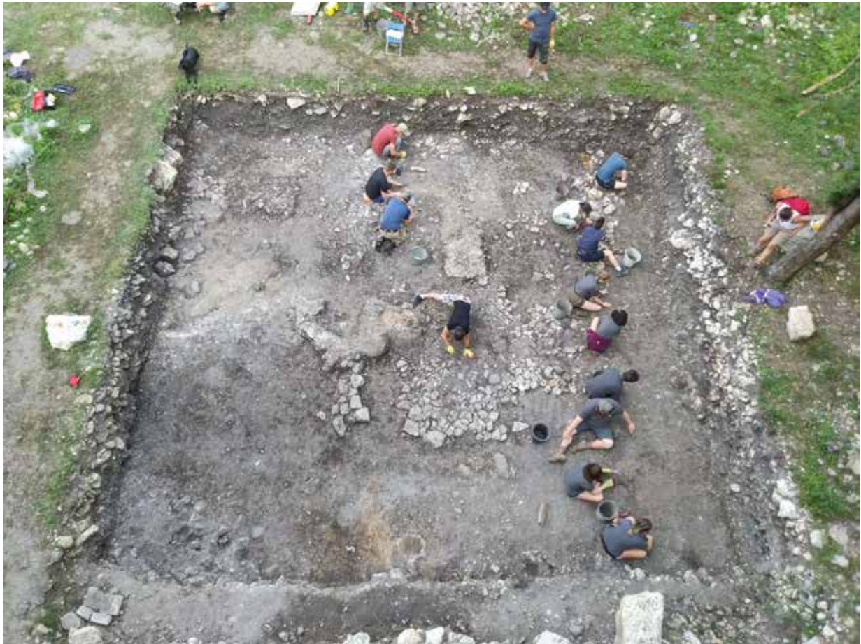
Fig. 6. Ukrainian and Georgian veterans working alongside the expedition's student volunteers in Trench G, Nokalakevi 2019.