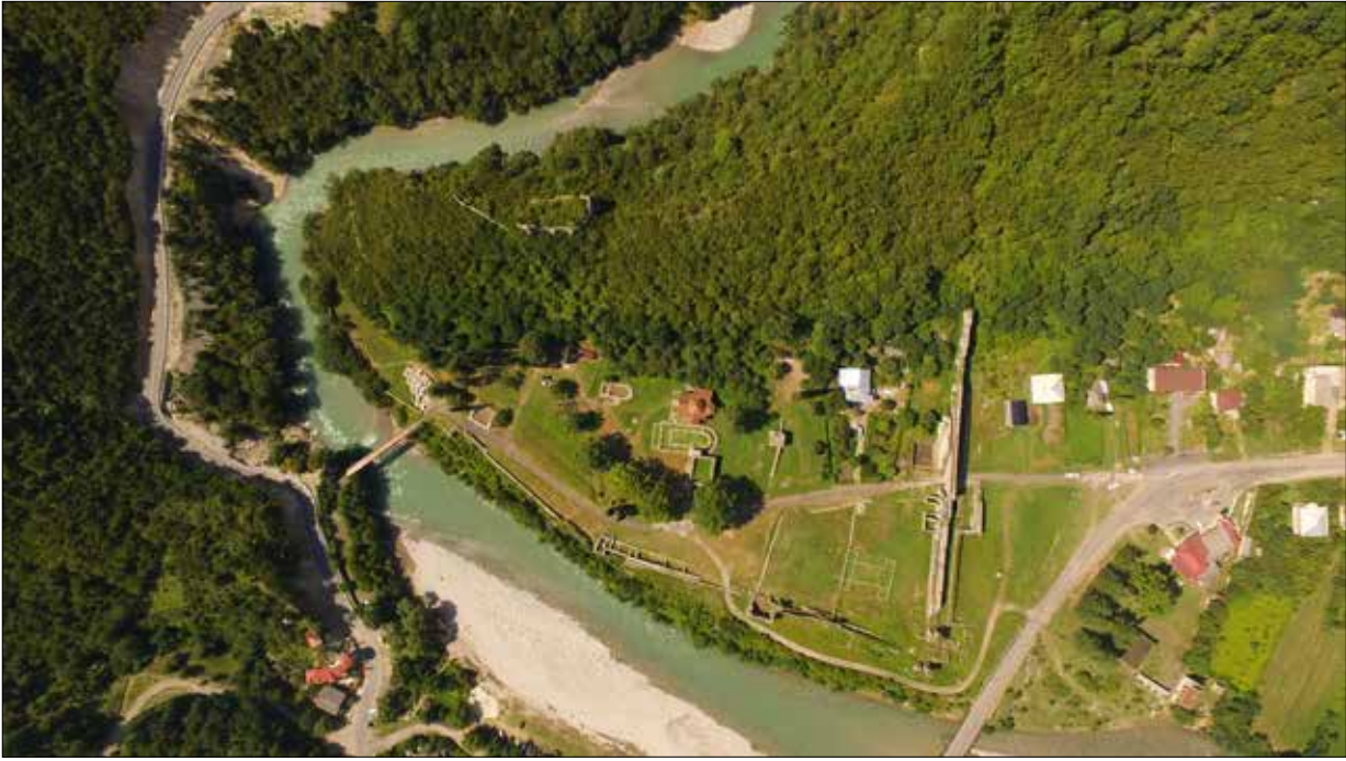
Fig. 2. Vertical drone photo of the “lower town” of Nokalakevi, enclosed within a loop of the Tekhuri River.