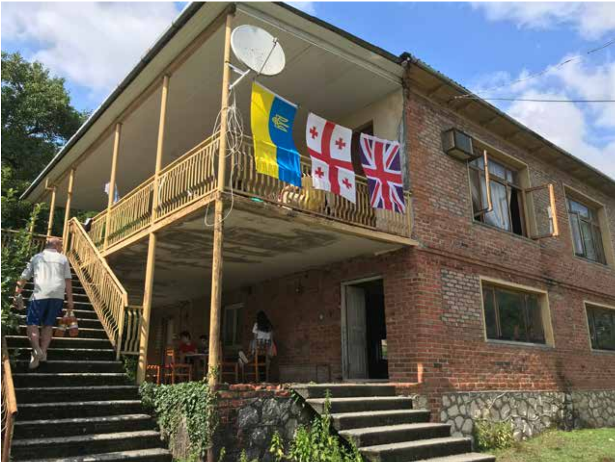
Fig. 5. The expedition “dig house” during the 2019 field season. As well as work, e.g. processing finds off-site, it was a social space where the whole team gathered for meals, and downtime after the working day.

ent people and, of course, nature. Most valuable communications were with veterans and our Georgian brothers.”