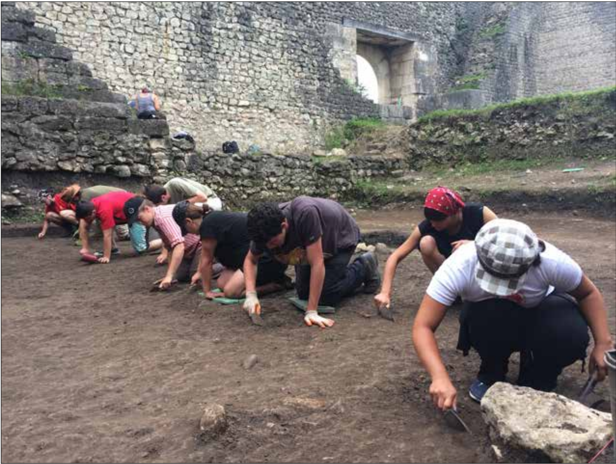
Fig. 4. Georgian and British students working together next to the standing fortifications of Nokalakevi-Archaeopolis.