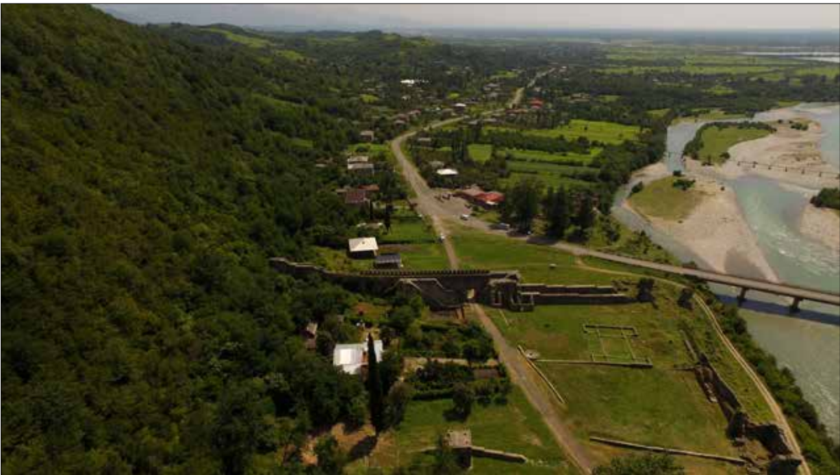
Fig. 3. Oblique drone photo, looking east, showing the location of Nokalakevi at the junction of the foothills to the north (left) and the Colchian Plain to the south.

that included moving the gate and changing the approach to it so as to prevent a frontal attack. Excavations in the upper town, or citadel, have revealed multi-phase towers at the northwest and northeast of the fortifications, and another small gate and probable guardhouse in the southwest corner.