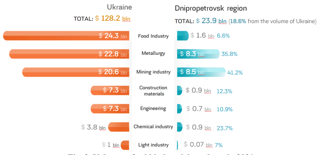
Fig. 3. Volumes of sold industrial products in 2021