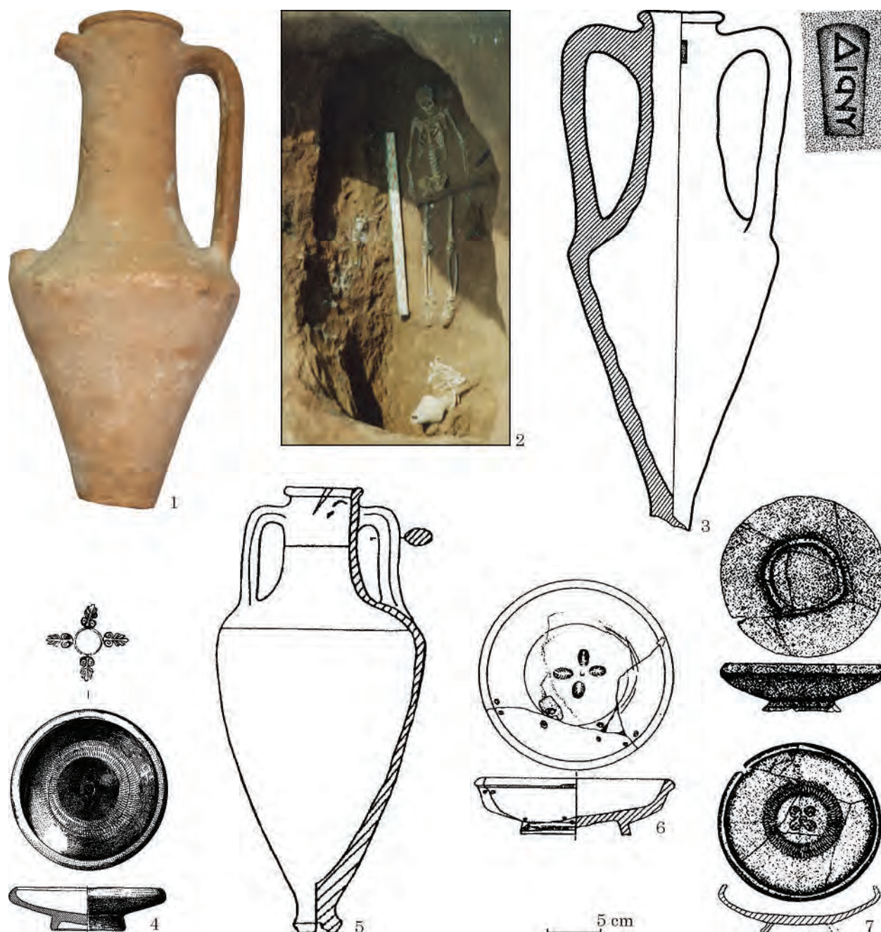
Fig. 3. Greek pottery of the late 4 th — first quarter of the 3 rd century BC from the Manych, Lower Volga basins and the foothills of South Urals: 1, 2 — Novo-Musinskii cemetery, Burial-mound 3/1999, Burial 1; 3, 4 — Krivaya Luka VI, Burial-mound 1/1973, Burial 14; 5, 6 — Koldyri Group, Burial-mound 25/1983, Burial 1; 7 — Zhaiyk I, Burial-mound 1/2019, Burial 1. 1, 3, 5 — Amphorae; 2 — the view of the burial; 4, 6, 7 — Black-glazed bowl. 1 — Sterlitamak, The Branch of the Bashkirian State University. Repository of the Educational and methodological Cabinet of Archeology of the Department of World; 3, 4 — Astrakhan' State Joint Historical-Architectural Museum-Reserve: 3 — acq. no. 19358, A-9999, 4 — acq. no. 22694, A-10334; 5—7 — Ural'sk, West-Kazakhstan Regional Center of History and Archaeology. Drawings: 3, 4 — after: Дворниченко и др. 1977; 5, 6 — after: Лукьяшко 2000; 7 — after: Лукпанова 2020

and with four palmettes in the center: Krivaya Luka VI, Burial-mound 1/1973, Burial 14 (fig. 3: 4) (Дворниченко и др. 1977, с. 67, рис. 71; Брашинский 1980, с. 105; Клепиков 2007, с. 41, рис. 15; Шинкаръ 2012, с. 194, рис. 2: 2; с. 195); Zhaiyk I, Burial-mound 1/2019, Burial 1, with holes along ancient cracks — traces of ancient repairs (not mentioned by the author of the publication, but clearly visible in the drawing published