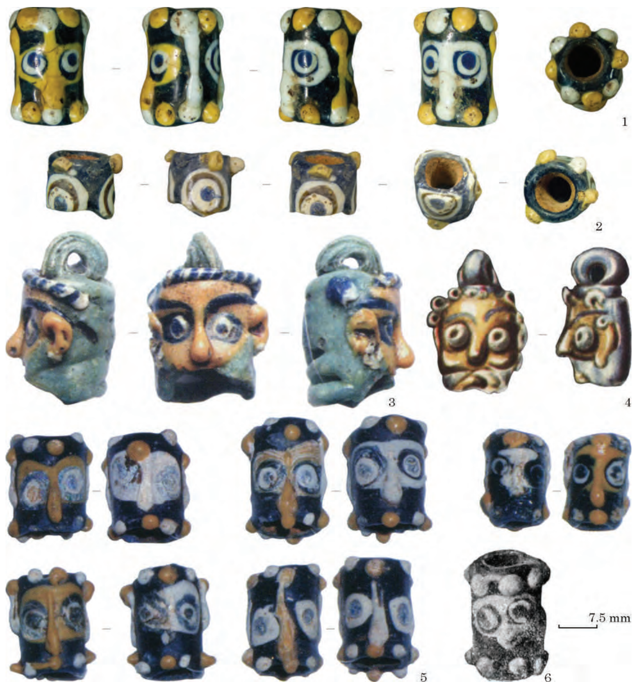
Fig. 2. Beads with masks and pendants with male faces from the Don region and the foothills of South Urals: 1, 2 — Mechetsai, Burial-mound 8/1961, Burial 5; 3 — Elizavetovskoe fortified settlement; 4 — Popov Farmstead, Burial-mound 58/26/1951, Burial 14; 5 — Necropolis of Elizavetovskoe fortified settlement, Burial-mound 133/2002; 6 — Chastye group, Burial-mound 1/1911 (1, 2 — Moscow, State Historical Museum, inv. no. 99564: 1 — list Б 1421/95, 2 — Б 1421/93; 3, 5 — after Копылов 2006; 4, 6 — Saint Petersburg, State Hermitage: 4 — after Мошкова 1963, 6 — after Замятин 1946)

29, 100—118; Tatton-Brown 1981, p. 143—151, figs. 11—15), represented by various variants in the North (Алексеева 1982, 41, типы 462—463, табл. 47: 10—23. 29; Гороховская, Цыркин 1982, с. 209—210; Кунина 1997, 63, рис. 23—24; 252 (илл.), 254, № 41—44; Dan 2011, p. 221—222) and Eastern (Turmanidze 2007, pl. I: 1; II: 1) Pontic area, were found in particular in the complex of the 4 th century BC at the Elizavetovskoe fortified settlement, the so-called jewel-