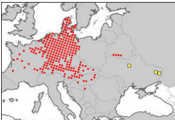
Fig. 2. Distribution range of the raccoon in Europe according to the review on web-resource DAISIE (Winter, 2009) and the location of the record described here from Kyiv and of the species' release in Luhansk region.

Threats of introductions and expansion. First, it is important to note that all of the studied cases of alien species impact on natural complexes are negative. This is a generally acknowledged fact. Secondly, it is important to remember that all countries where the raccoon expands its range programs to counteract were urgently adopted (Salgado, 2018; CABI, 2019). The species' particular niche (predatory arboreal mammal) practically does not overlap with that of other species (partly with the niche of the wildcat and pine marten), but its expressive polyphagia (Bartoszewicz, 2011) makes the raccoon much more competitive than all local predatory mammals. Particularly striking are the effects of its predation on "low" nesting and terrestrial nesting birds and their clutches, which numbers can fall by 10 % in 10 years (Schmidt 2003; Winter, 2009). Another possible threat is potential involvement in zoonoses (Winter, 2009, etc.). However, as our studies have shown, records in the Rabies Bulletin Europe database regarding Ukraine and submitted as "raccoon" should be interpreted as "raccoon dog" (!) (Zagorodniuk, Korobchenko, 2007), which is related to the above mentioned confusion in the vernacular names of these predators. Accordingly, reports on the "raccoon's" participation in zoonoses refer to the "raccoon-like dog", i.e. Nyctereutes procyonoides .