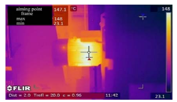
Fig. 3. A thermogram of the induction generator

A thermal imager was used for verification of the adequacy of the thermal model. The thermogram of IG operation at self-excitation is presented in Fig. 3. It is seen in the figure that IG rotor windings heats up to the temperature of 148.7 °C. The results of comparison of the experiment and modeling (Fig. 2) revealed that the calculated excess of temperature with the use of expression (5) is 158 °C. It suggests the conclusion that the proposed approach is adequate. The analysis of the obtained results revealed that the stator end windings are the most heated IG parts.