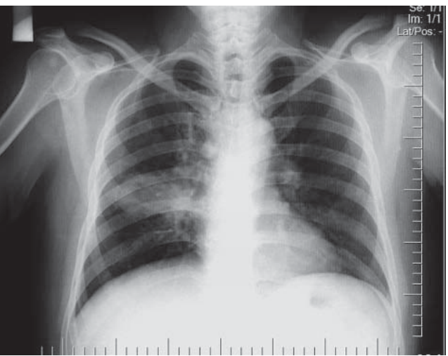
Fig. 2. Chest radiograph revealed irregular shaped lesion in middle lobe of the right lung

heterogeneous mass lesion with contrast enhacement that extending from the right hilar region to the middle lobe and collapsing the central lobe brochus was detected. Abdominal computerized tomography, upper and lower gastrointestinal endoscopy were normal. Maxillary sinus and eye metastases were confirmed with magnetic resonance imagining. Bronchoscopic biopsy with the preliminary diagnosis of lung cancer was reported as lung adenocarcinoma. Gemcitabine + cisplatin treatment was started.