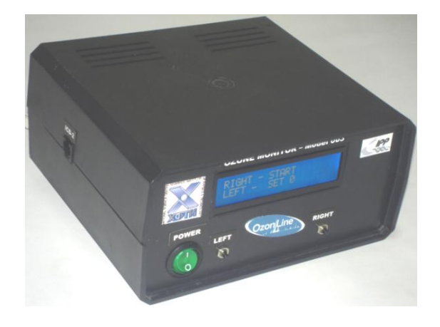
Fig. 1. OCM-003 ozone concentration meter

The structural scheme of the device is shown in Fig. 2.