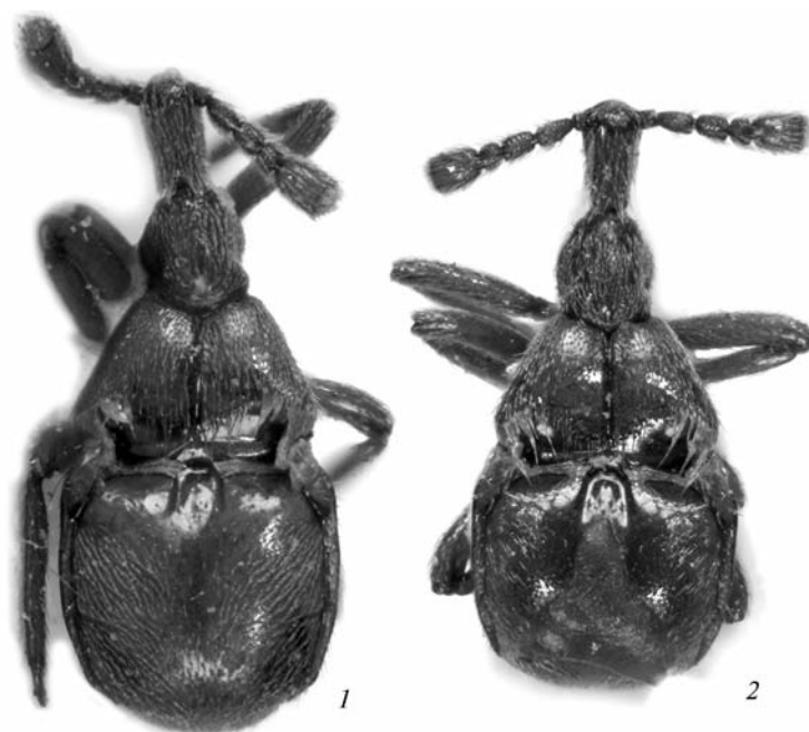
Fig. 3. Claviger colchicus : 1, 2 — habitus (dorsal view).

Рис. 3. Claviger colchicus : 1, 2 — общий вид сверху.