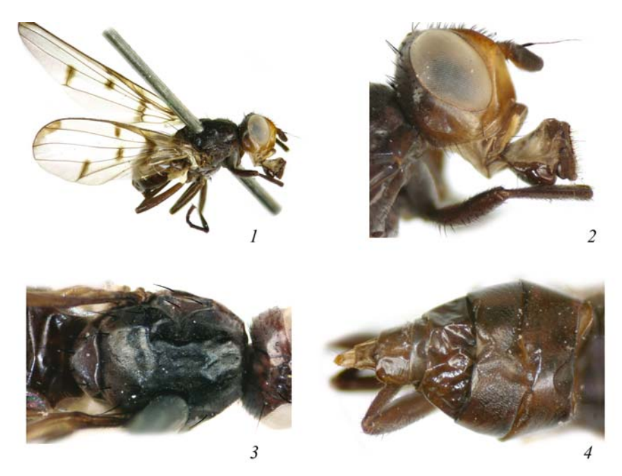
Fig. 1. Herina arjunae sp. n., holotype \sigma (1-3) and paratype \varphi (4): 1 – habitus, right; 2 – head, lateral view; 3 – mesonotum, dorsal view; 4 – abdomen, dorsal view.

Description. Head (fig. 1, 2): length: height: width ratio = 1 : 1.15 : 1.33. Frons matt, with orange frontal vitta, very narrow silver microtrichose bands along eye mar-