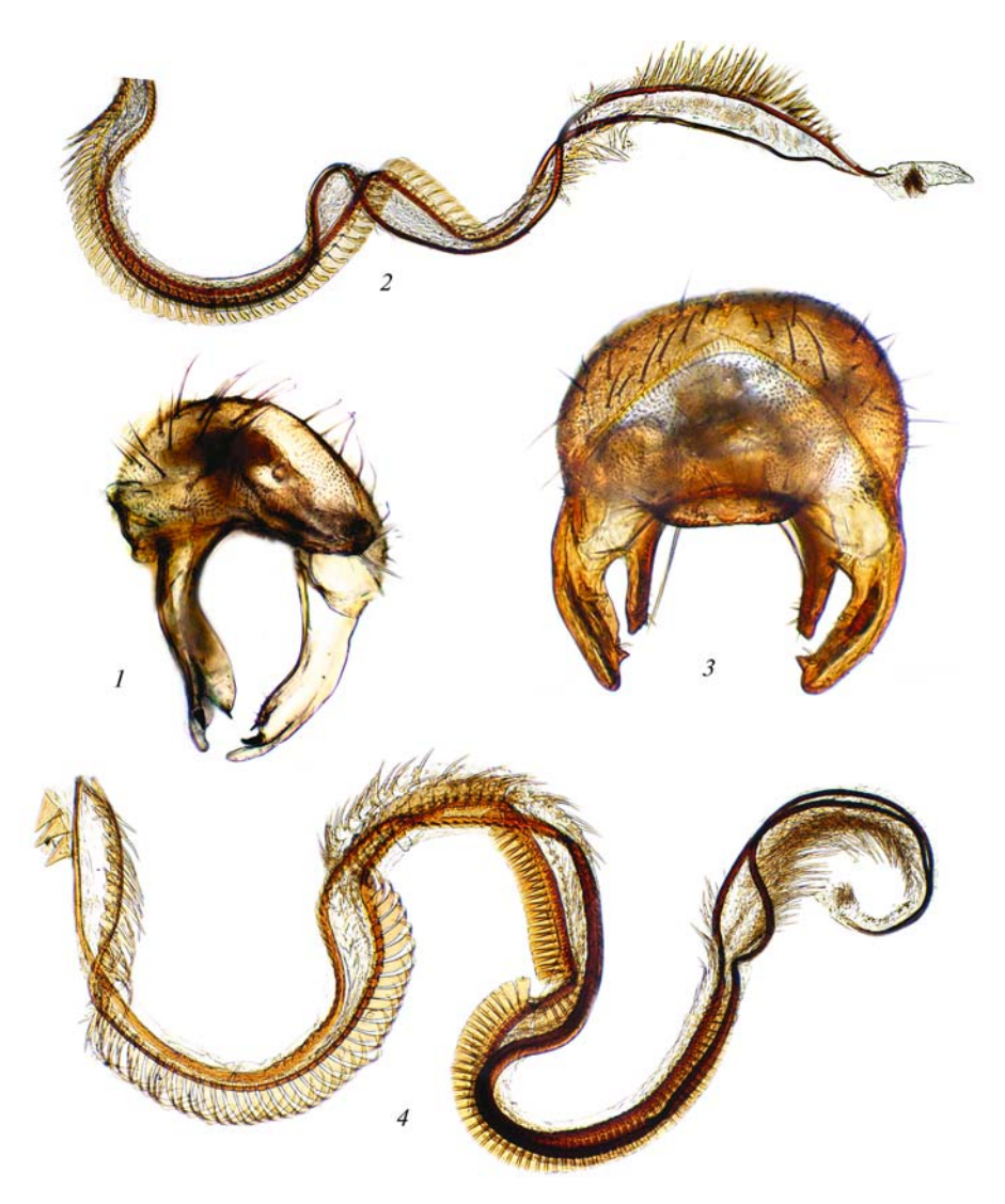
Fig. 3. Herina scutellaris (1–2) and H. narytia (3–4) male genitalia: 1, 3 — epandrium; 2, 4 — phallus. (Fig. 3, 3, 4 modified from Kameneva, 2007.)

Measurements: WL = 3.8-4.6 mm ( \circlearrowleft ), 4.1-4.6 mm ( \circlearrowleft ). BL = 4.5-5.2 mm ( \circlearrowleft ), 5.0-6.0 mm ( \circlearrowleft ). AL = 0.8 mm.