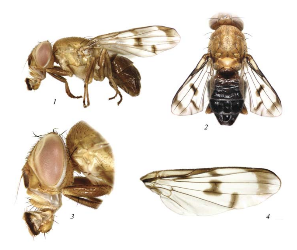
Fig. 1. Herina caribbeana sp. n., \sigma (1, 3–4 — holotype): 1 — habitus, left; 2 — mesonotum and abdomen, dorsal view; 3 — head, lateral view; 4 — wing.

Рис. 1. Herina caribbeana sp. n., \sigma ( 1 , 3–4 — голотип): 1 — общий вид, слева; 2 — среднеспинка и брюшко, сверху; 3 — голова, сбоку; 4 — крыло.