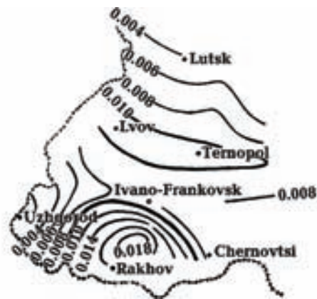
Fig. 2. Western Ukraine gravity change as a result of movement of air masses [Dvulit, 1999].

In (Geophysics, 2008. — 73, № 6) does not take into account the peculiarity of the gravity variations: a fluctuations in the value of its derivatives depend on the fluctuations of the low-level geophysical events (as anomalous atmospheric masses (Fig. 2),