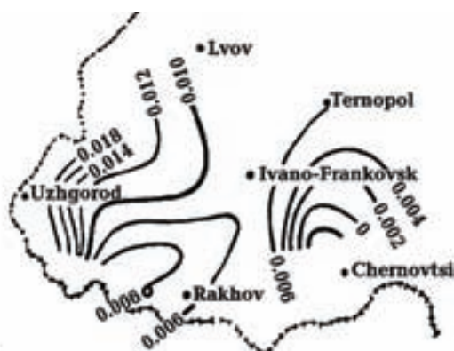
Fig. 3. Western Ukraine gravity changes as a result of mass transfer in the subsurface area [Dvulit, 1999].

the snow masses, the groundwater level, forest cover and changes in topography (Fig. 3) due to anthropogenic activities. We can take into account these effects through the entering corresponding corrections [Dvulit, 1999] into the solution of direct problems of gravimetry in the areas of study (it is assumed that due to long-term monitoring period of station is known the structure beneath the area).